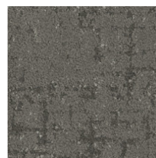
Slate 84518 LRV 14.3