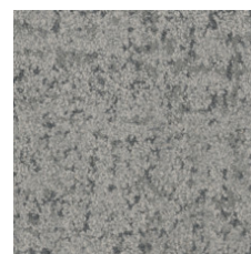
Mineral 84535 LRV 25.8